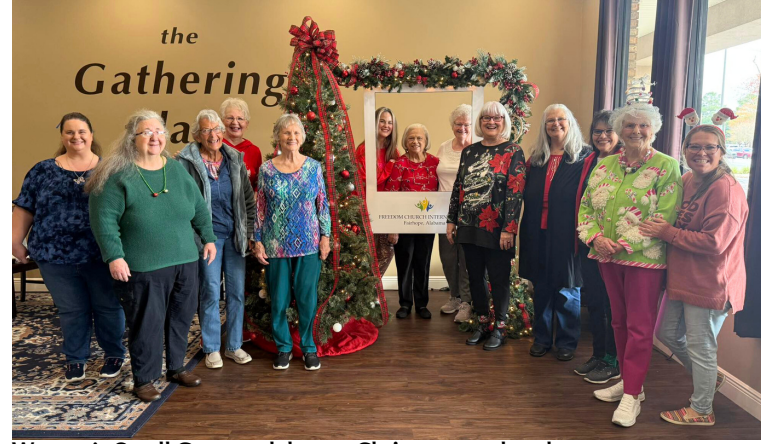
Women's Small Group celebrates Christmas at church.